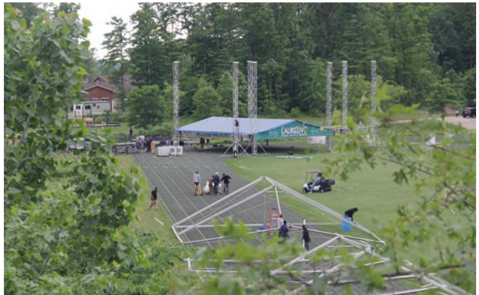
Above: Main stage under construction. This shot shows the distances and obstructions we were dealing with.

vendors. These APs provided service to the vendors who flanked the field and fans on the field between the two main stages.