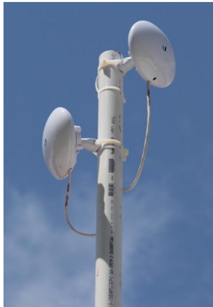
Above: NanoBeams atop the box office

trees. So we used Ubiquiti NanoBeams for point-to-point connections. NanoBeams require clear line-of-sight alignment and the beam is easily obstructed — even, as we learned, by a few leaves. We had to trim some branches and tie down others. The management software on the NanoBeams allowed us to tweak the alignment for maximum signal strength.