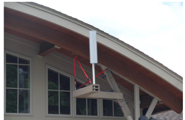
Above: Ubiquiti Rocket AC

On the north side, however, where the two main stages were, a Rocket AC wouldn't work. There were too many