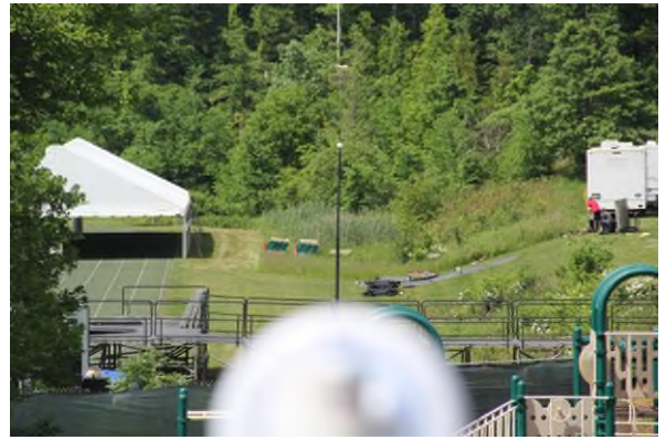
Above: A shot from behind one of the Nanos used for point-to-point connection. The receiving Nano is on top of the pole in the distance.

allowed us to monitor the system in real time, and send alerts to our laptops and mobile devices during the festival. We were able to detect problems and fix them before anyone else even noticed. The day before the event began, one of the NanoBeams kept going offline. Later that night, we learned that the most recent firmware update contained some significant flaws, including duplicate broadcast and multicast traffic, switchport flapping, and other critical issues. Fortunately, Ubiquiti had just that day released a revised firmware to solve these issues. We updated everything again and had no issues.